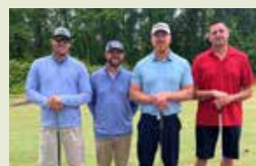
Tony's Service Center