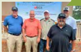
Moore's Since 1948