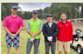
Wayne Country Day