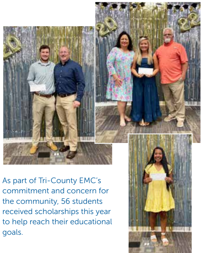
As part of Tri-County EMC’s commitment and concern for the community, 56 students received scholarships this year to help reach their educational goals.