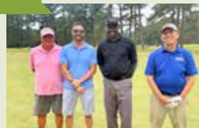
Mount Olive Builders